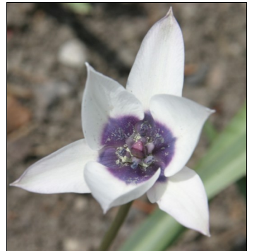
Even the tulips are letting us know it's time to get started